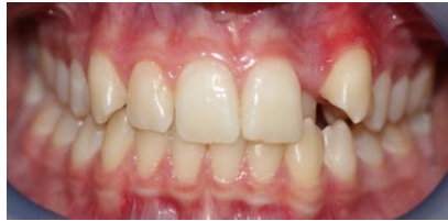
FASTBRACES® Before and After Result after 11mths